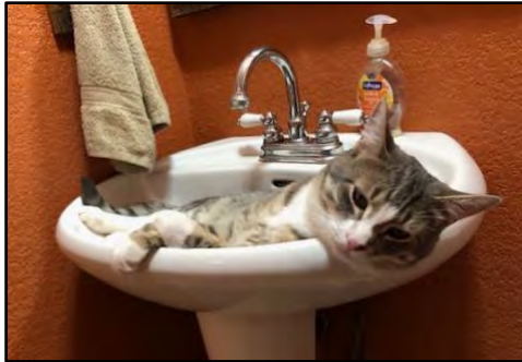
Meanwhile, Odie stays home for his sink time.

Have a dirty pooch? Come to Dog Wash Alley behind the Enterprise Fire Department on the second Saturday of every month this summer from 11am to 3pm. We supply shampoo, or bring your own. There will be warm water and clean towels for each dog. $10 big dogs, $5 little dogs – you wash or we wash, price the same. Volunteers are welcome to join the fun. Snacks for helpers and dogs too.